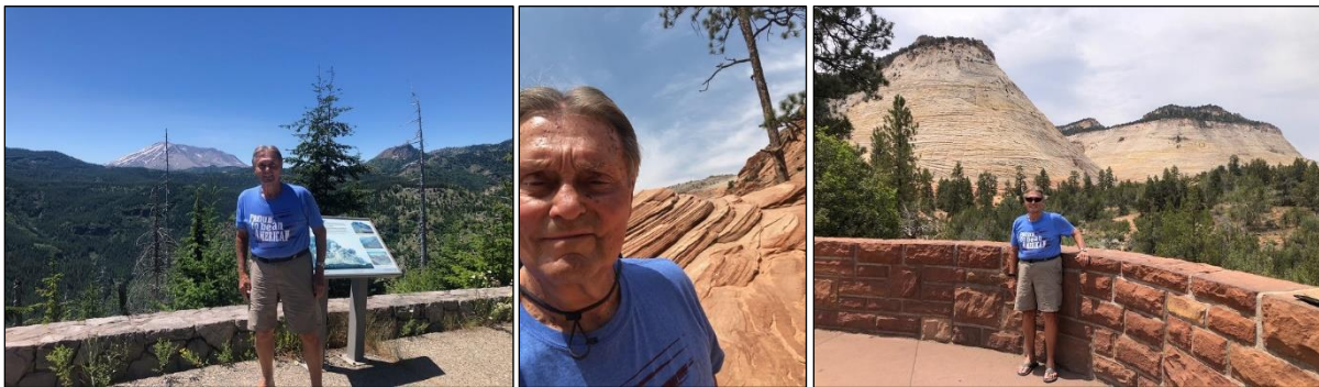
Mt. St. Helens National Monument (left) and Mt. Zion National Park (center and right)