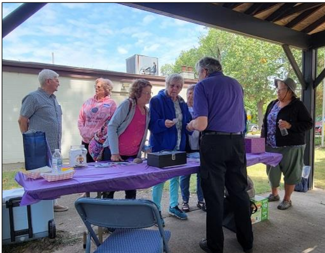
HHS alumni line up at the table at BrickieFest 2022.

The BrickieFest Homecoming Picnic was held on Saturday, September 24, from 12 noon to 3:00 pm at the Hobart VFW, 540 S. Indiana Street. Brickies of all ages were served free hot dogs, brats, chips, and bottled water, courtesy of the HHS Alumni Association. The Class of 1959 held a reunion inside the VFW the same afternoon. Thanks to all who came!