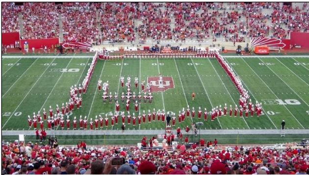
The IU Marching Hundred in formation.

During my senior year of high school, Indiana University wasn't always my first choice. But I instantly fell in love with the campus and the people the first time I visited - it felt like home. I realized that I could easily combine my passions for business and law by studying at one of the nation's top business schools, the Kelley School of Business. Ranging from great academics to the stellar packed-stadium atmospheres, there are so many aspects of this university that make me proud to be an Indiana Hoosier.