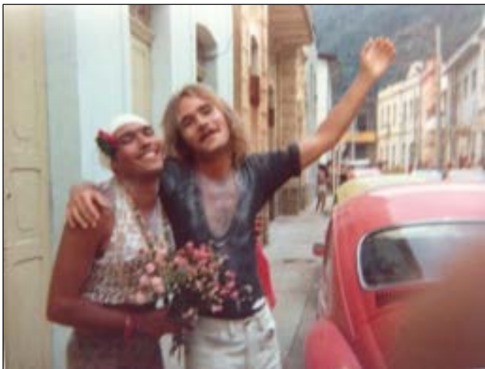
Carnival! That's me on the right, unknown reveler on the left

I graduated in 1972 and was accepted into the School of Music at Indiana University. I played in the Hobart High School concert band and jazz band (we called it stage band back then) and wanted to become a great jazz trombonist. Soon after I arrived at IU, I realized that there were a lot of musicians much more accomplished than me.