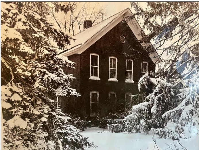
The Stafford house on South Linda Street in Hobart