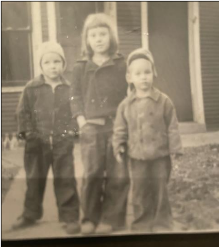
A "Christmas Story" childhood.