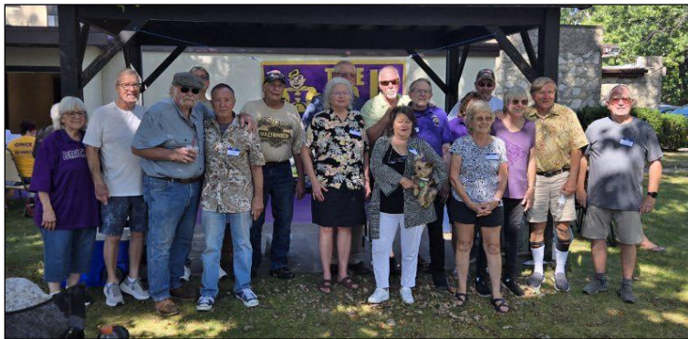
The HHS Class of 1970 had the most attendees (17).