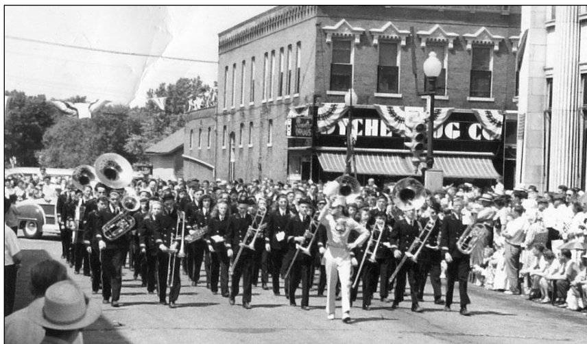
The Hobart High School Band marching downtown at 3rd and Main Streets, in 1945.

The biggest problems I see today for teens are drug and cellphone addictions. God gave each of us a body, a mind and a spirit. Take care of them. Nurture them. That's all. The rewards are great and life is wonderful!