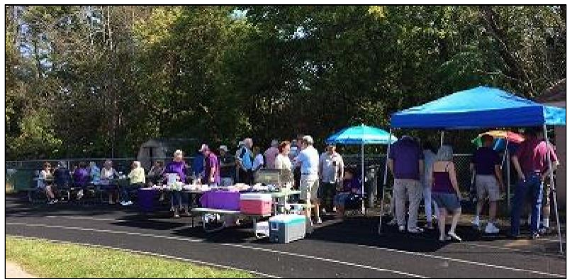
Last year's BrickieFest Picnic was held at Brickie Bowl. This year, the picnic will be at the Brickyard.

The Homecoming football game will be on Friday evening, September 14, against Andrean High School. The game starts at 7:00. Come for the weekend: cheer on the Brickies on Friday night, and meet your friends at the BrickieFest picnic on Saturday!