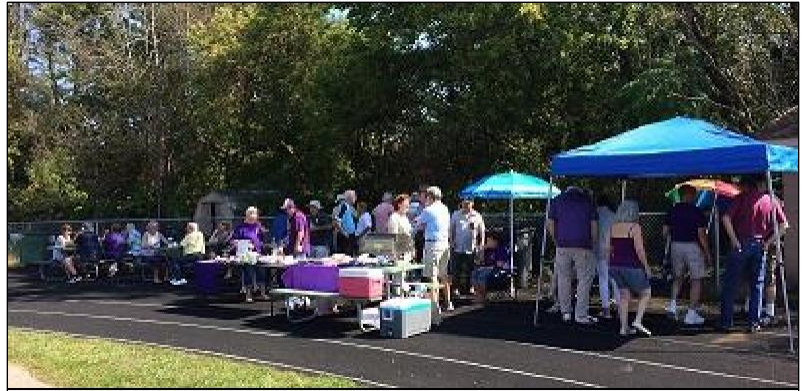
Last year's BrickieFest Picnic was held at Brickie Bowl. This year, the picnic will be at the Brickyard.

The Homecoming football game will be on Friday evening, September 14, against Andean High School. The game starts at 7:00. Come for the weekend: cheer for the Brickies on Friday night, and meet your friends at the BrickieFest picnic on Saturday!