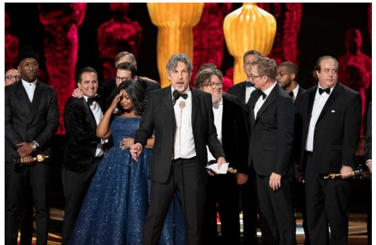
Receiving the Academy Award for Best Picture

Also, surround yourself with people who love you. I gave the alumni speech at Indiana State University's commencement last spring and that was the theme of my talk. Don't be afraid to tell people what you want to do and those who love you will help. My friends and family growing up weren't connected to the entertainment business at all. However, their support and encouragement over the years led me to the right places to give me a shot at making it and put me where I am today.