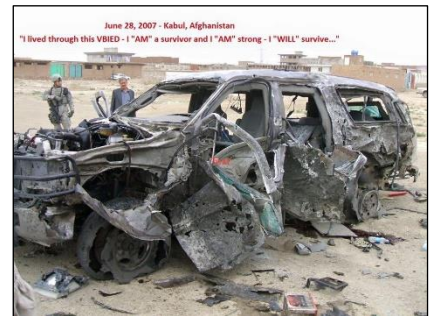
A vehicle blown up by the Taliban in Kabul.

I spent the first 6 months in Kabul. After the Afghan government televised our arrival the Taliban tried to figure out our vehicle movements. On June 28, 2007, they found our Kabul team and blew one of our vehicles up with a VBIED. I